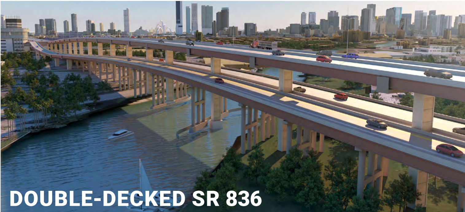
DOUBLE-DECKED SR 836